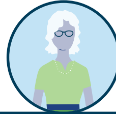
Mary, 50 years old

John and his spouse have some discretionary income and want to round out their retirement plan with long-term care coverage. He would like to enter retirement with his CareMatters II policy paid up. That way, there will be one less expense to cover with his retirement income, should he need long-term care later in life.